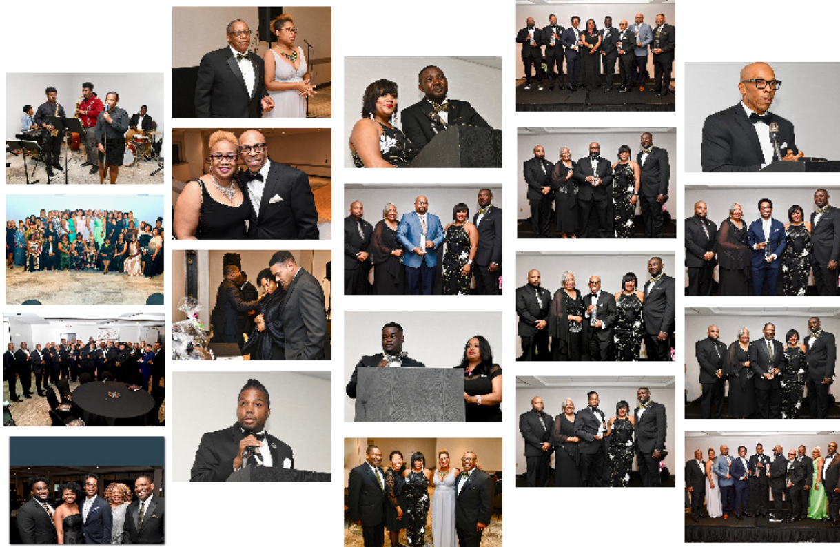
Photos of the 2018 Paragon Awards

On behalf of the Phirst Phamily partnership, the nearly 500 professional and college educated members representing these organizations, thank you for your strong consideration and support of this special event.